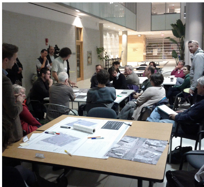
St. George's Square public workshop at City Hall in October 2013.

In addition, a staff Technical Committee and General Manager Committee from different departments has prepared and reviewed the material produced.