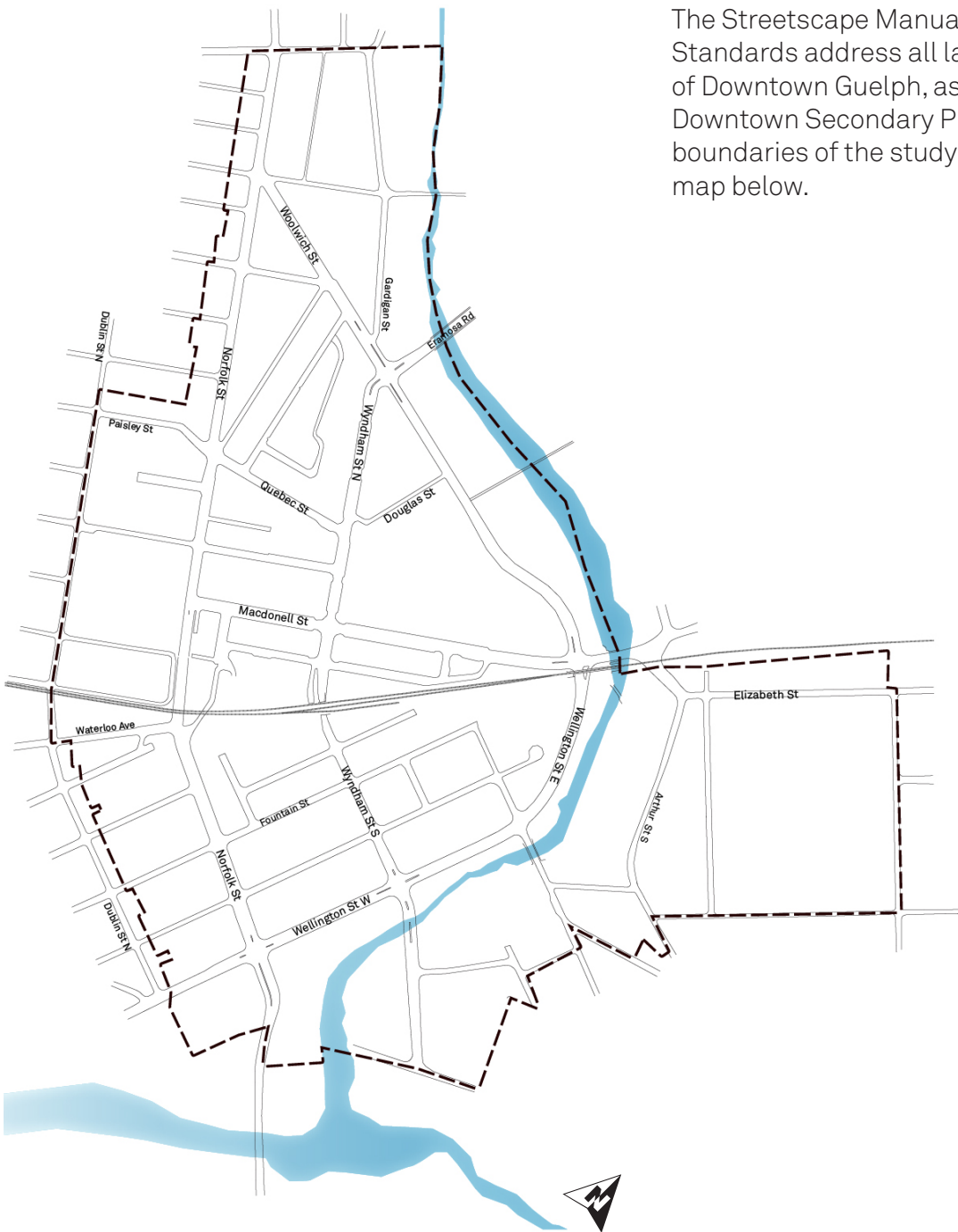
Map illustrating the study area boundaries.

The Streetscape Manual and Built Form Standards address all lands within the boundary of Downtown Guelph, as identified within the Downtown Secondary Plan (2012). The precise boundaries of the study area are delineated in the map below.