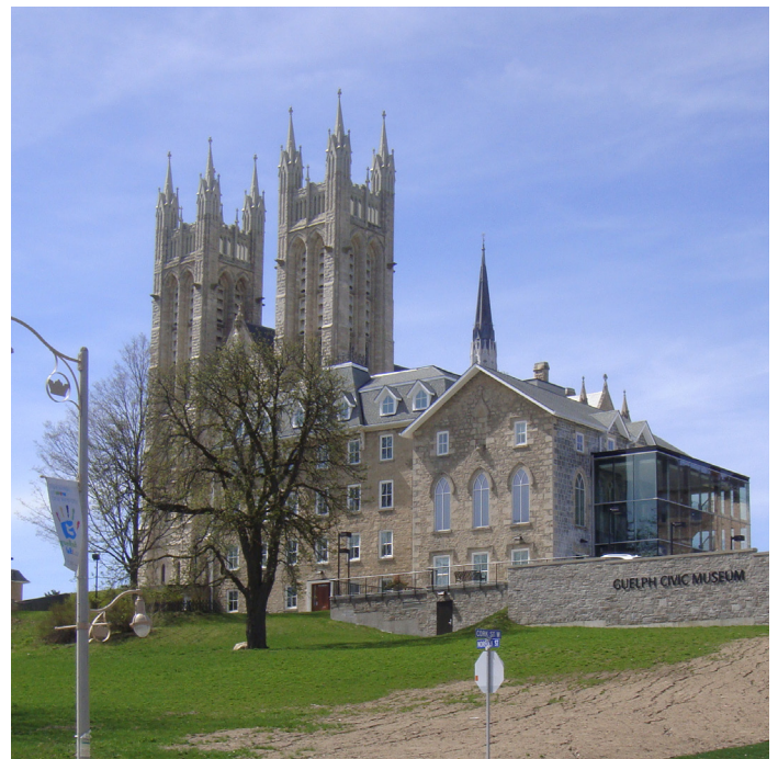
Church of Our Lady Immaculate.