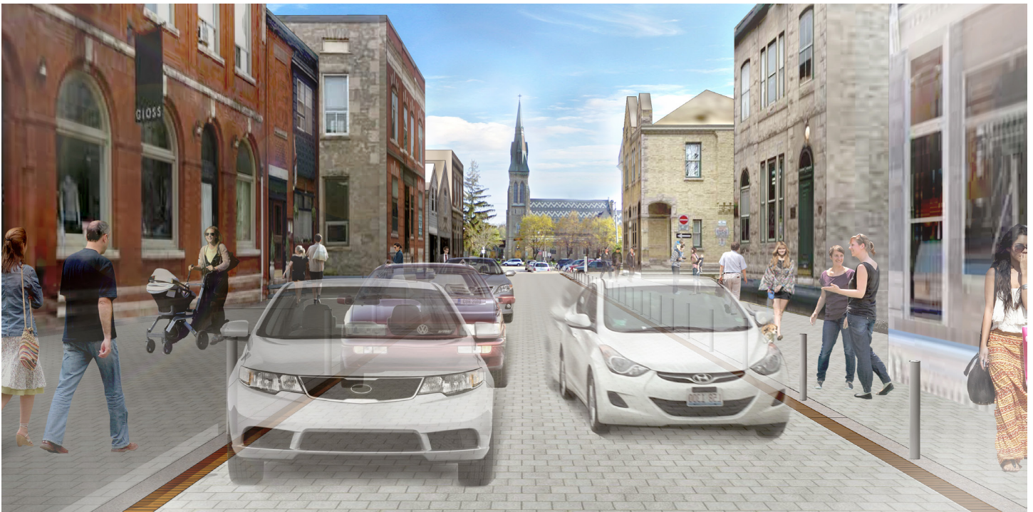
Rendering of Douglas Street, redesigned as a flexible and curbless street.

Finally, the Streetscape Manual discusses Implementation considerations, order of magnitude costings and presents a series of sample technical details which can be used as a template to redesign downtown's streets.