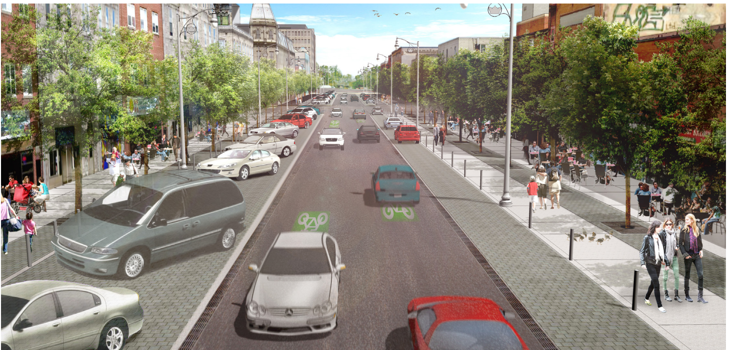
Rendering of Macdonell Street, redesigned as a flexible and curbsless street.