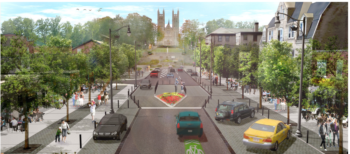
Rendering of Macdonell Street, redesigned as a flexible and curbsless street.