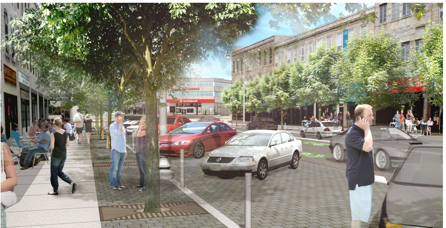
Rendering of Wyndham Street, redesigned as a flexible and curbsless street.

Guelph's downtown streets are mixed in character, architectural quality and intensity. Enhanced public and private open spaces, pedestrian connections and linkages, continuous street trees and beautiful pedestrian areas will improve quality of life in Downtown Guelph.