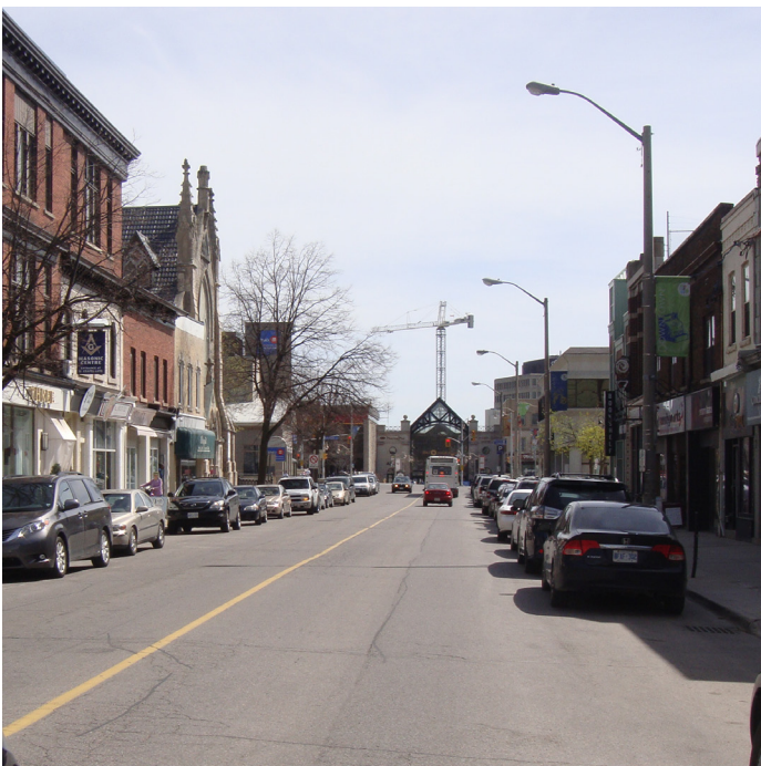
View looking along Quebec Street.

These revised documents provide design direction to private investment and new development in the Downtown. The Built Form Standards also provide policy direction for future updates to the City’s Zoning By-law in implementing the Downtown Secondary Plan. In addition, the Built Form standards incorporate a complete Heritage Conservation Analysis of the Downtown.