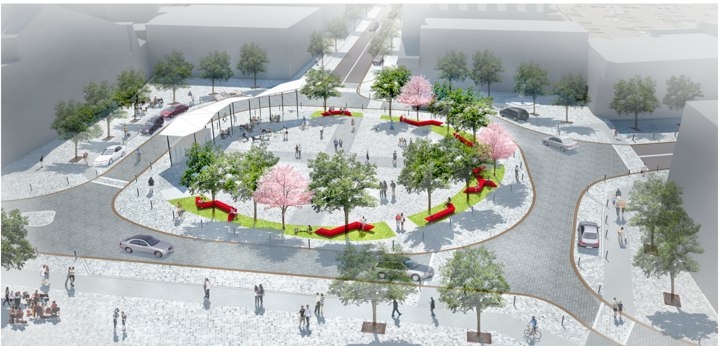
Rendering of conceptual design for St. George's Square.

The report provides an overview of the implementation strategy associated with the redesign and redevelopment of St. George's Square. The Implementation Strategy includes an overview, a phasing strategy which considers both short and long-term strategies, and a summary of proposed order of magnitude costing.